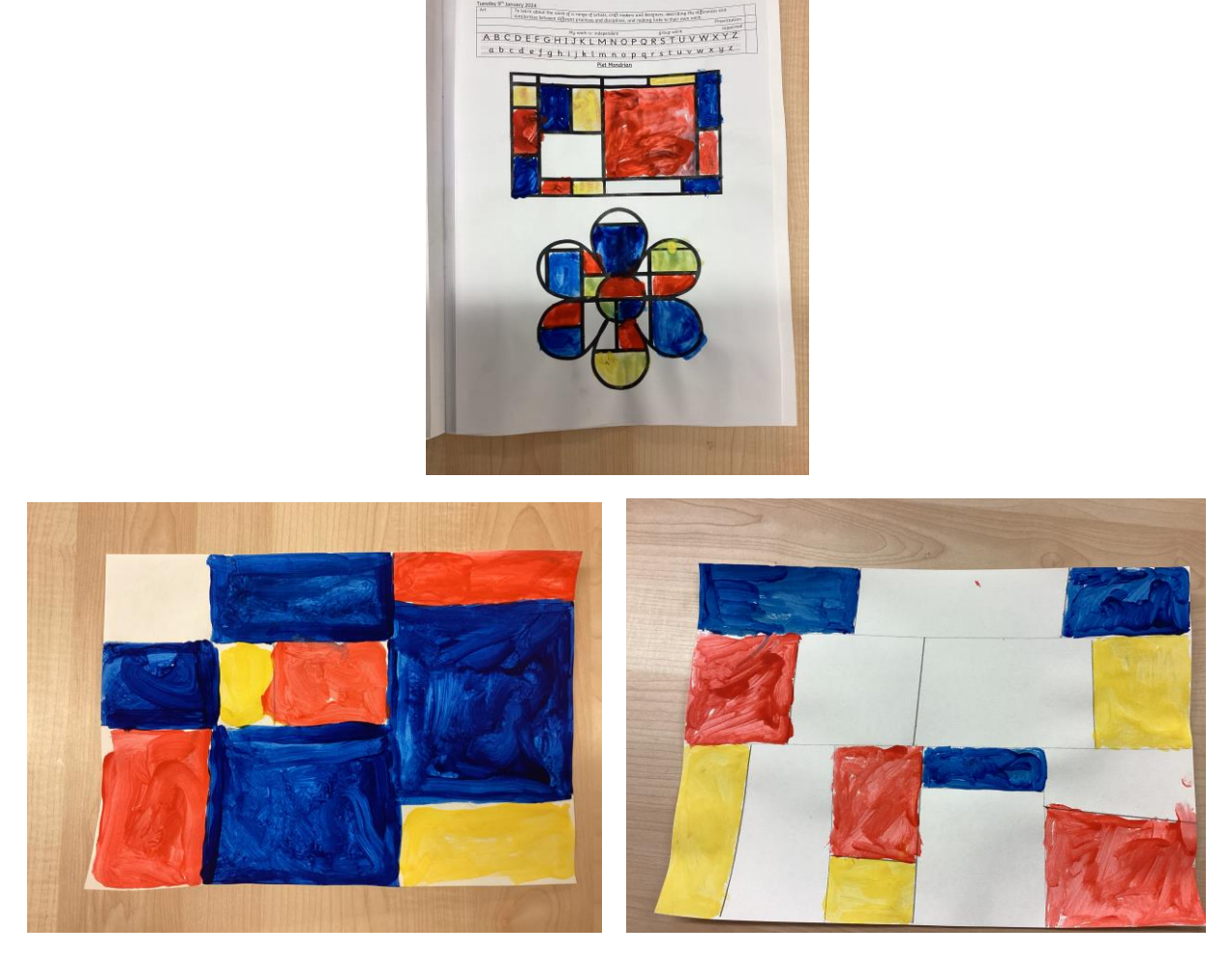
Completes Art Work – Children enjoyed using the Primary colours to create their designs and also learnt how to use a ruler while doing their art.